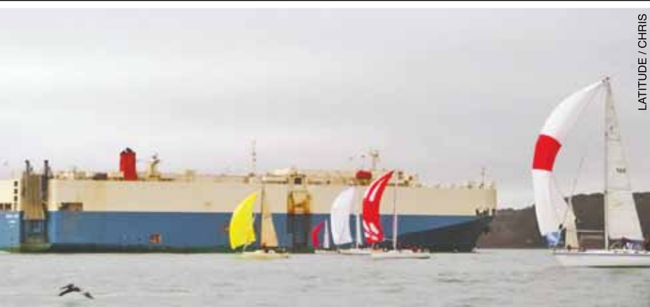
LATITUDE / CHRIS